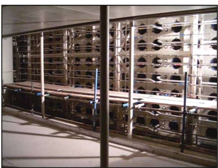
Nozzle Array Erection at Taweelah B Plant